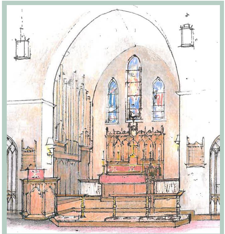
Donations are still being sought for the Chancel Redesign Project, which will result in an even more beautiful, better functioning, and accessible worship space. Memorial or other contributions can be sent directly to: Emmanuel Episcopal Church, 5 Bryant Street, Wakefield, MA 01880.

As it happens, Sunday, August 21, 2011, is the 130th anniversary of the very first service in our building. We are planning for a big celebration on that day, giving thanks for our rich heritage and looking to the future with hope and confidence. The completed chancel renovation will help us to do just that. Mark your calendars and plan to join us as we celebrate this historic parish anniversary.