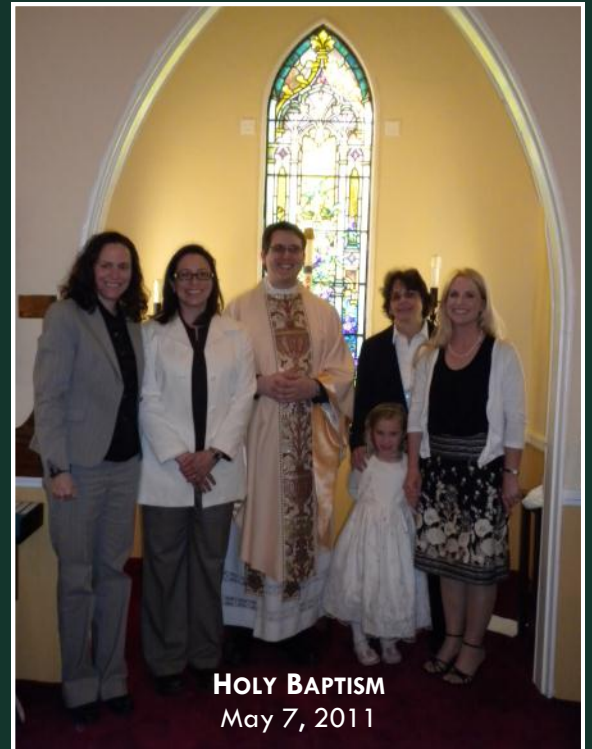
HOLY BAPTISM May 7, 2011