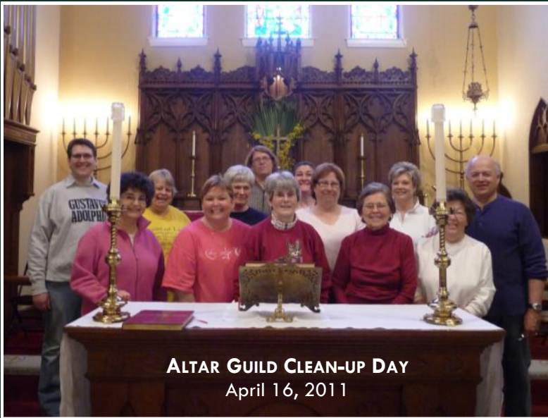
ALTAR GUILD CLEAN-UP DAY April 16, 2011