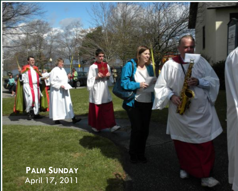
PALM SUNDAY April 17, 2011