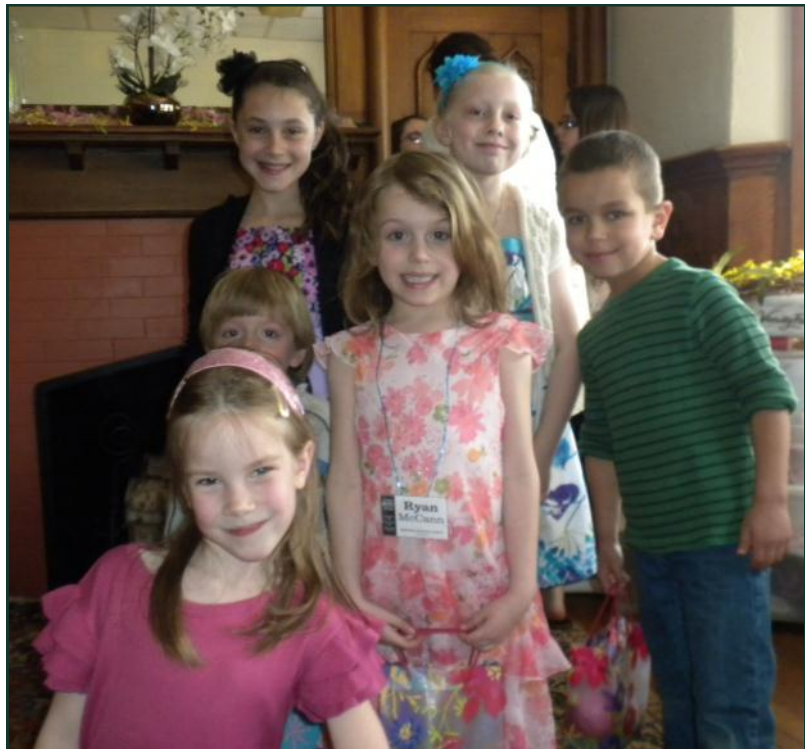
This group was all ear-to-ear smiles after the annual Easter Egg Hunt on Easter morning.

This summer will present us at Emmanuel with an opportunity to reflect back on the year that has passed, while also looking forward to what God has planned for us. We took a (continued on Page 2)