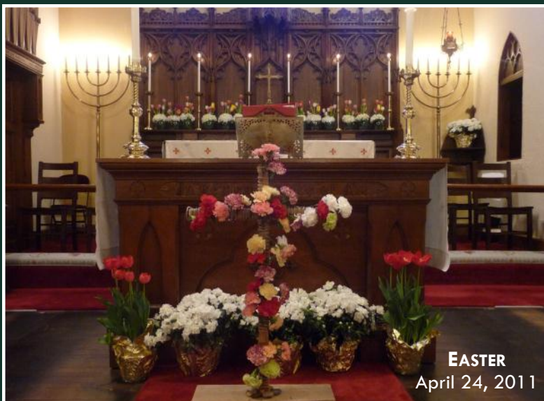
EASTER April 24, 2011